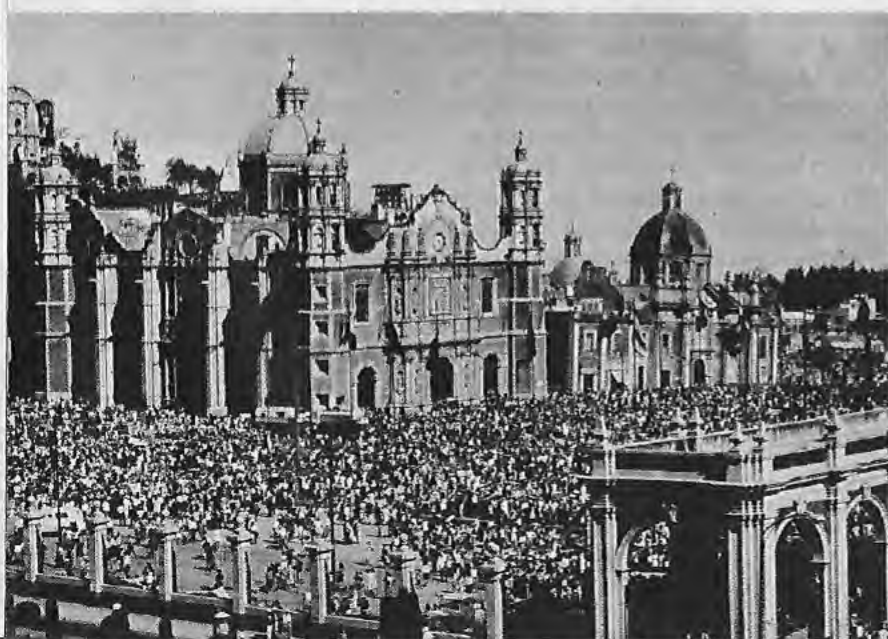
The Basilica of Our Lady of Guadalupe in Mexico City

We went therefore to the concelebrated Mass, and as soon as we arrived and I noticed the turbulent jumble and confusion of the people, absolutely without any devotion or respect, I felt great sorrow. But the culminating point arrived at the time for holy Communion. If, during Mass, it happened that absolutely everybody, excepting ourselves, remained standing and conversing with one another, the same thing continued now at Communion. Some young men came down to give Communion, without cassocks or surplices, much less a stole—not even a Roman collar. Instead, they were dressed as seculars, and in a slovenly manner: their shirts were unfastened at the neck, as though they were on a spree or as though relaxing in their family circle, and although rows were formed to give Communion, everyone was standing, talking until the moment of communicating, and after having received Communion, laughing and moving from one side to the other, without any reverence.